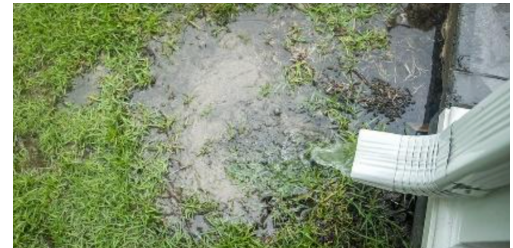
drain spout should be far enough away from your home so water doesn't pool