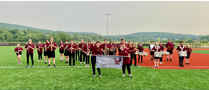
McGraw Marching Band