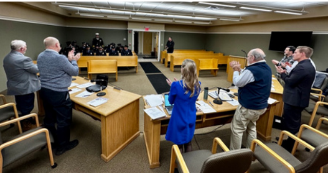
The Town Board recognized the Cortlandville Fire Department for their heroic efforts in keeping our Town and residents safe.