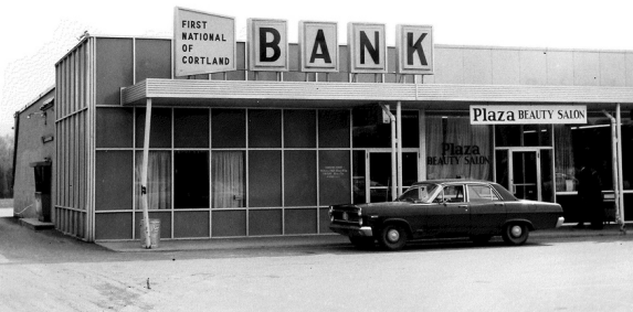
First National Bank of Cortland was located in the Groton Ave Plaza